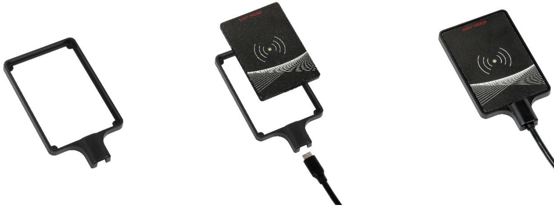
TWN4 Slim mounting frame (exemplary illustrations)

The ELATEC product portfolio also contains a wide range of accessories, like wall holders, additional cables or RFID antennas, that are perfectly suited for use with the different ELATEC devices. As part of the accessory portfolio, ELATEC offers a mounting frame for the RFID readers of the TWN4 Slim family.