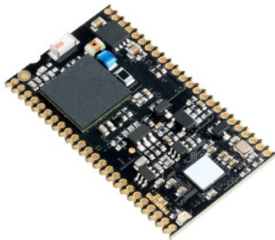
C0 version (SMT mounting) Top view

Miniature RFID module (LF/HF/NFC/BLE) for external 50 Ohm antenna